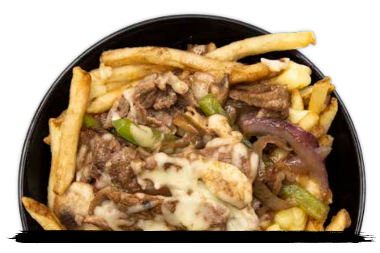
Philly Cheesesteak Poutine

chopped crispy chicken, bacon, cheese curds, green onions, sweet bbq & sweet chili bang bang sauce