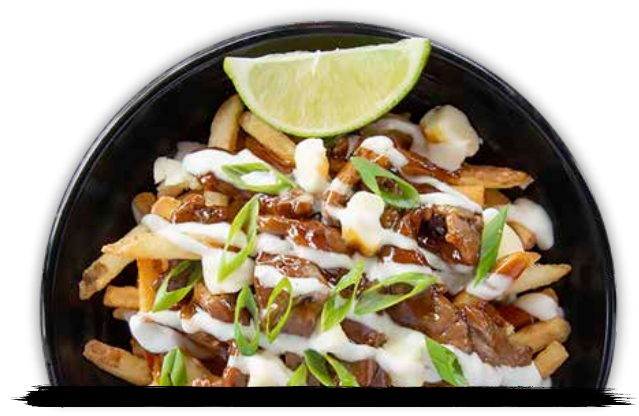
Tokyo Beef Poutine

creamy butter chicken, cheese curds, green onions