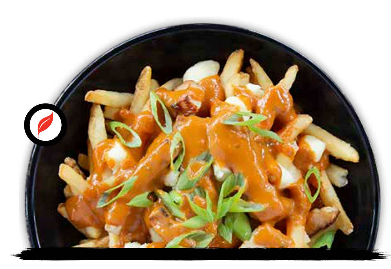
Butter Chicken Poutine b

creamy butter chicken, cheese curds, green onions