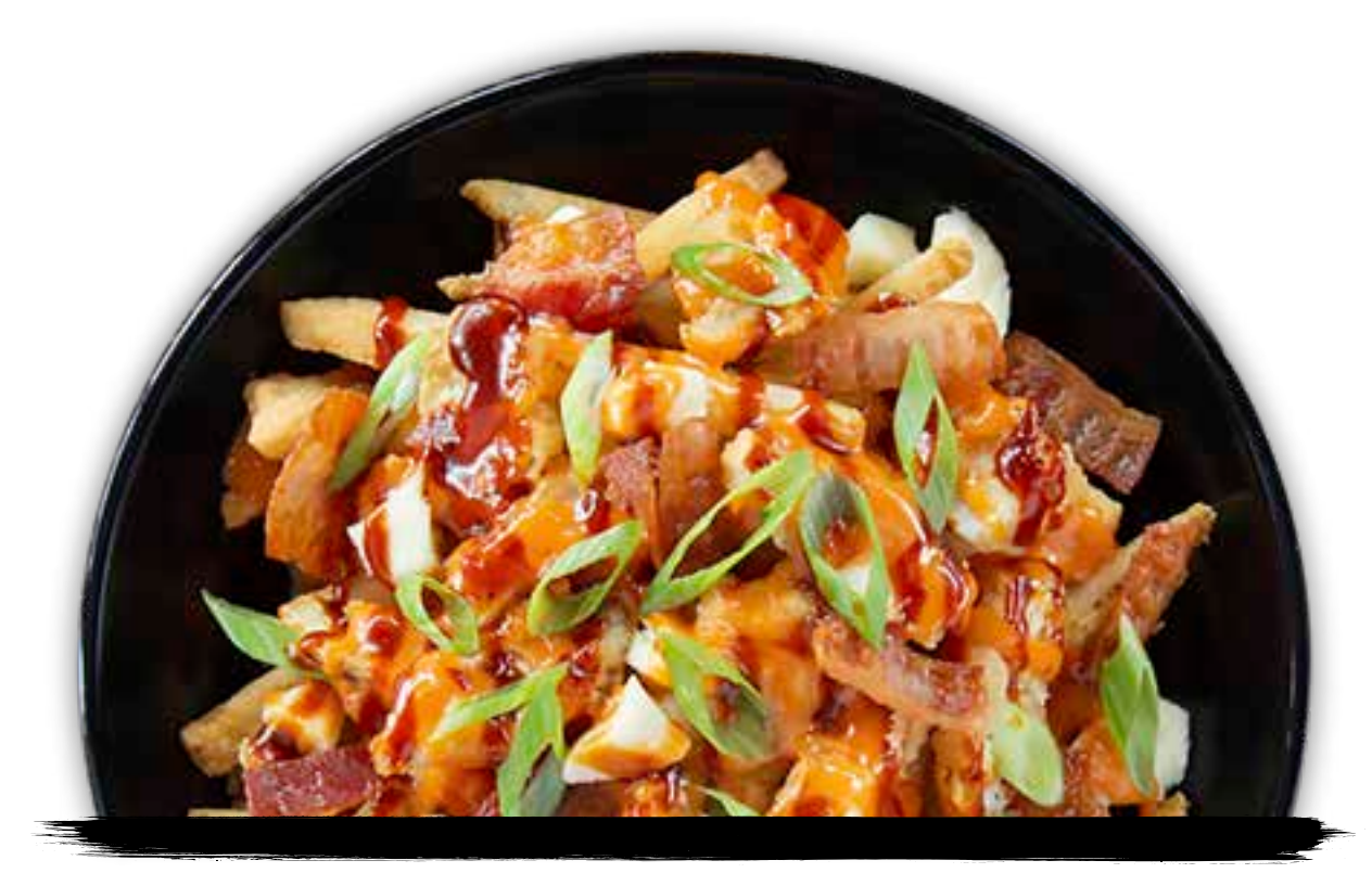
Fully Loaded Fries

sweet teriyaki beef, cheese curds, lime aioli, green onions, lime wedge