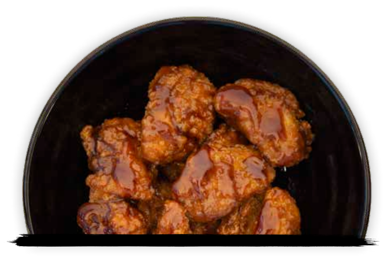
Boneless Chicken Wings Breaded